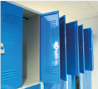
Versatile for indoor